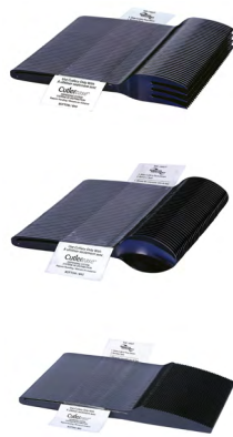
CUTLERY REFILL PACKS