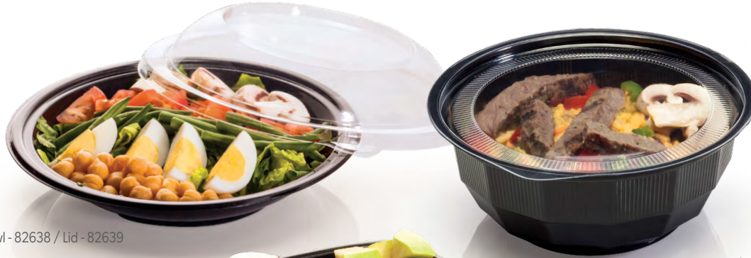
Bowl - 82638 / Lid - 82639

WNA™ Atrium™ bowls are stylish options that offer a retail look which enhances presentation and visibility. PETE suitable for cold food only. Check with your local recycling facility to ensure these containers will be accepted.