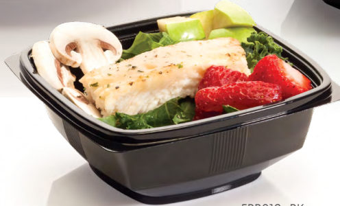
5BB012 - BK