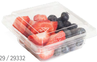
29829 / 29332