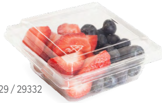
21829 / 29332