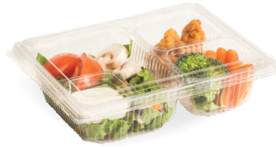
Tray - 82723 / Lid - 82725

Entrée and meal trays are ideal for your larger reimbursable meals, vending machines and complete meal solutions. Suitable for warm and cold foods. Check with your local recycling facility to ensure these containers will be accepted.